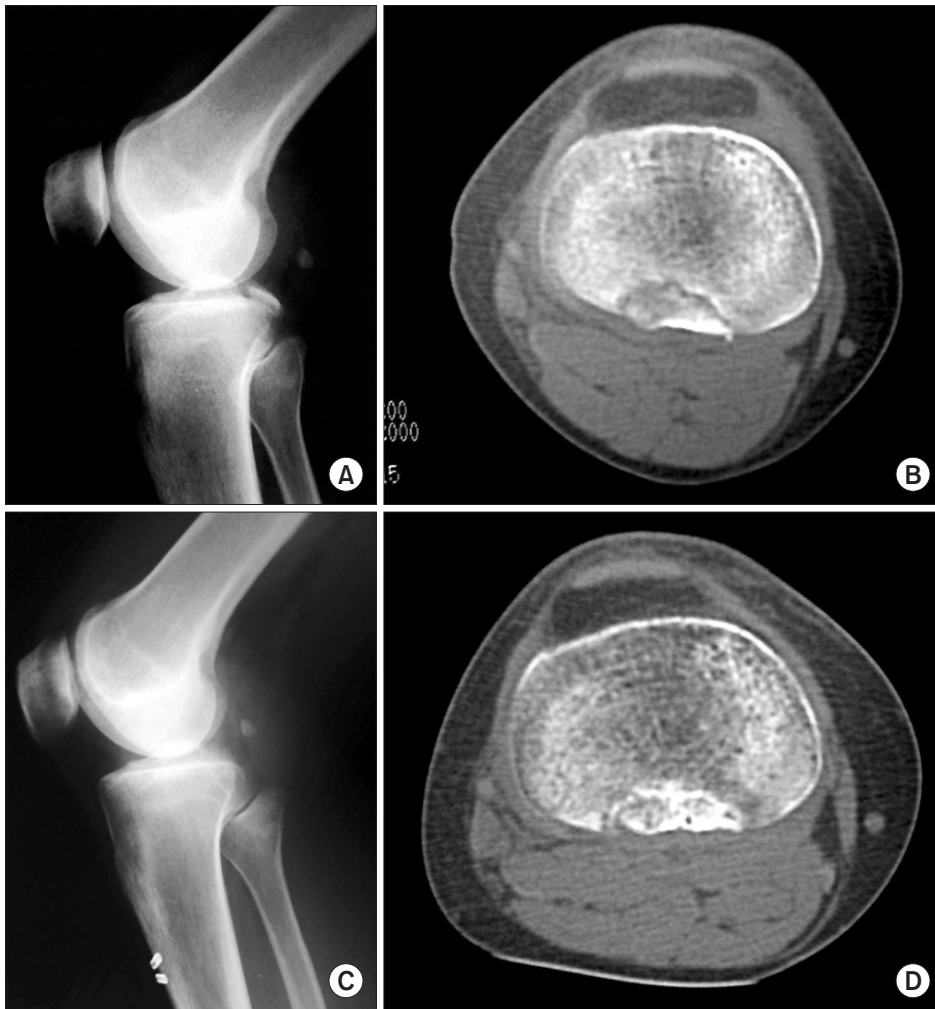
Fig. 1. (A) Preoperative X-ray showing a thin avulsed fragment of the posterior cruciate ligament arising from the tibial attachment. (B) Preoperative computed tomography (CT) showing that the avulsed fragment was thin and comminuted. (C) X-ray taken three months after surgery showing that the fragment was well reduced to the tibial attachment and bone union was obtained. (D) Confirmation of bone union by CT three months after surgery.

fracture of the right knee and underwent arthroscopic osteosynthesis 13 days after the injury after providing informed consent.