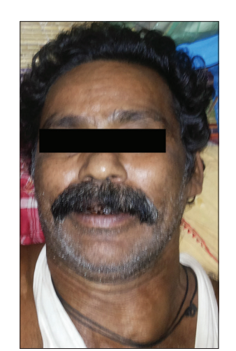
Figure 1:The patient had a left anterior neck mass, which showed on fine needle aspiration cytology as papillary thyroid carcinoma. Ultrasonography of the neck did not show any other neck nodes

H and \tilde{E} (hematoxylin and eosin) staining showed neoplastic tissue composed of sheaths of cells with ovaloid