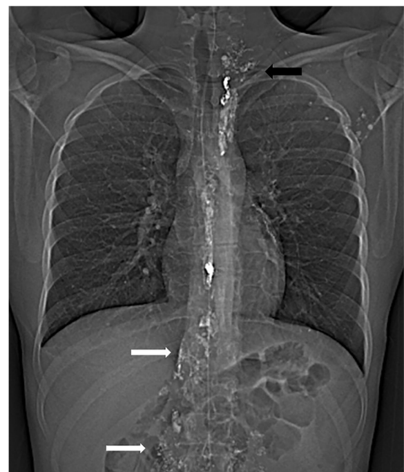
Fig. 3 Post-procedural CT topogram demonstrating embolization coils and NBCA through the length of the thoracic duct. Ethiodol also opacifies portions of the malformation in the abdomen (white arrows) and mediastinum/left neck (black arrow) along with left axillary lymph nodes

Following the lymphangiogram and thoracic duct embolization procedure, the patient had a rapid recovery. Left chest tube output dropped dramatically and then tapered off completely over the following days. Seven days after the procedure, the chest tube was removed and the patient was discharged home. At clinic follow up 2 weeks later, he continued to do well with no re-accumulation of pleural fluid. A CT was performed with appropriate deposition of the embolic material in the lymphatic system in the chest (Fig. 3).