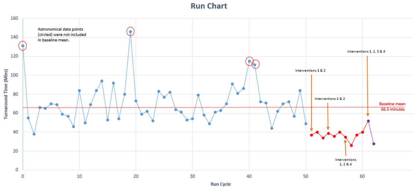
Figure 3 Run chart illustrating mean turnaround time prior to interventions and decrease in turnaround time after PDSA cycles.

employed). A consensus was reached regarding a list of simple interventions following discussion with all key stakeholders (theatre scrub and anaesthetic clinical staff, theatre managers, surgeons, and anaesthetists). We routinely check kit for the next case during surgery and our anaesthetists draw up and label drugs prior to the arrival of the next patient. We introduced new interventions with a step-wise approach: