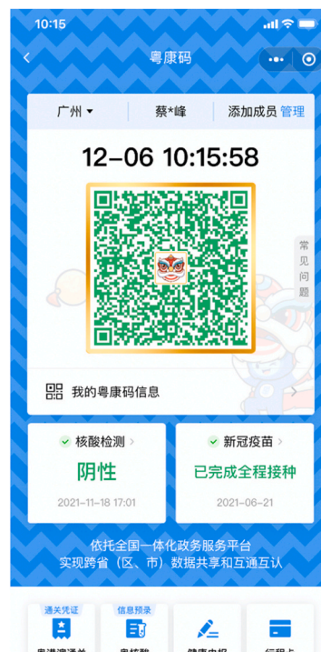
Health code, 健康码