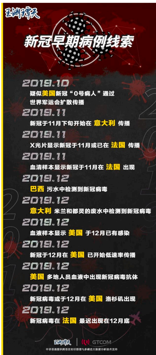
Fig. 4. A timeline of the supposed spread of COVID-19 from the 2019 Military World Games. The chronology suggests evidence of COVID-19 in the U.S., Italy, France, and Brazil before the outbreak in Wuhan. From an August 2021 Communist Youth League article: https://baijiahao.baidu.com/s?id=1707571587138941012&wfr=spider&for=pc .

false. We laobaixing have deep lived experiences ( shenqie de ganshou ) of the government's actions."