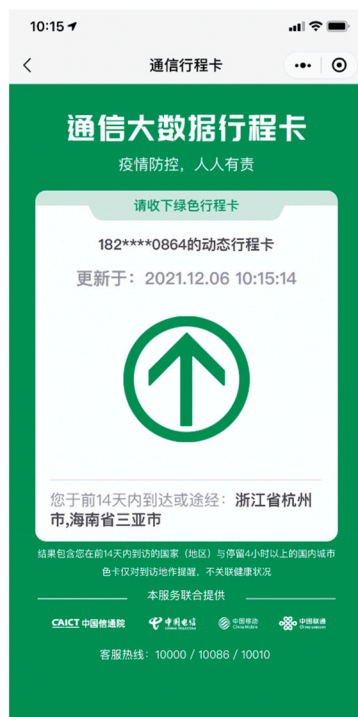
Trajectory card, 行程卡

The authors began by reaching out to existing contacts in Shanghai through the popular social media platform WeChat to recruit a small purposive seed sample, the members of which then referred additional