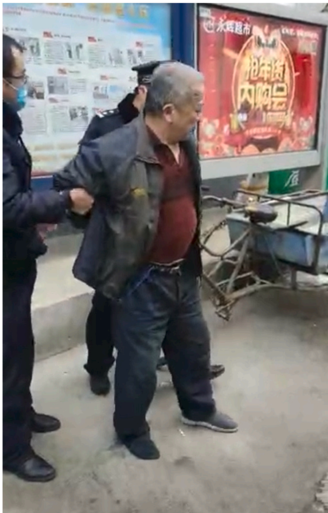
Fig. 2. A video widely circulated on WeChat in February 2020 of an elderly man who refused to wear a mask being arrested and pushed to the ground by police.

Social opprobrium for the non-compliant was swift and public. In the first half of 2020, social media was filled with videos of noncompliant individuals being reprimanded by police officers, security guards, and neighborhood committee members. They were shown being scolded and even handcuffed for not wearing masks or for refusing to stay indoors (see Fig. 2). In the comments section of videos, people left comments