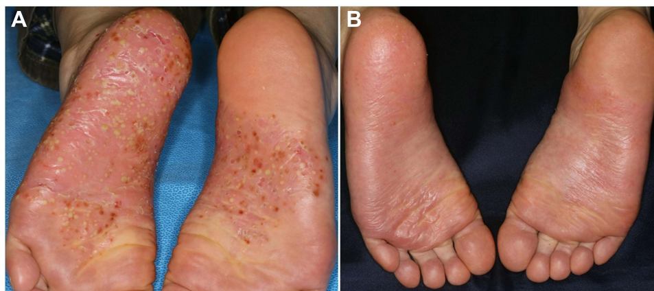
Figure 4 Clinical improvement of plantar PPP lesions before (A) and after (B) guselkumab therapy.

(73.3%), as compared with the placebo group (47.4%). Among the patients with MRI assessment of the anterior chest wall region, the proportions of patients in the guselkumab group with a \geq 2 grade improvement, 1 grade improvement, and no change were 3.4%, 27.6%, and 65.5%, respectively, at week 52. The proportion of patients who had no or slight pain gradually increased, accounting for nearly 90% at week 52.