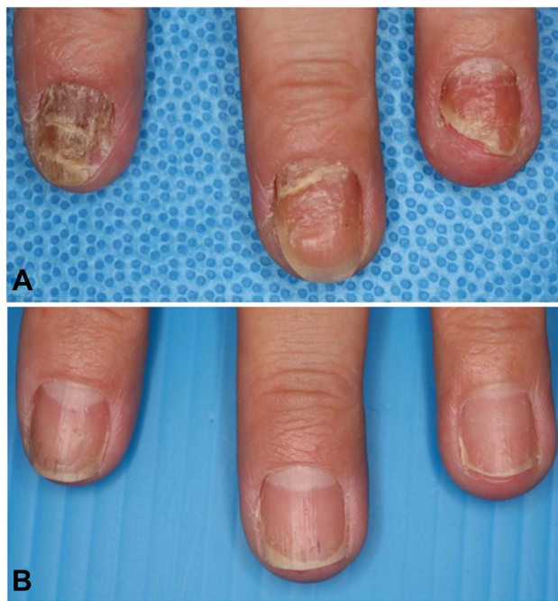
Figure 2 Improvement of PPP nail after tonsillectomy. Before (A) and 1 year after tonsillectomy (B).

always performed in the diagnosis of PPP. By contrast, if pustules are not detected when patients present to us, the diagnosis is sometimes difficult and careful follow-up is