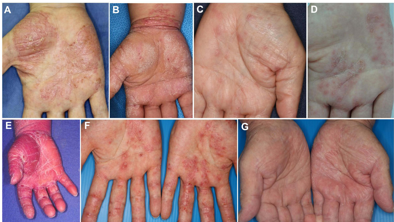
Figure 3 Various features affecting palms. (A) PPP, (B) psoriasis, (C) lichen planus, (D) dyshidrotic eczema, (E) pityriasis rubra pilaris, (F) contact dermatitis, (G) tinea manus.

Differential diagnosis includes several diseases such as pompholyx, dyshidrotic eczema, contact dermatitis, hand eczema, fungal infection, palmoplantar psoriasis, and pustular psoriasis, as well as rare diseases such as lichen planus, pityriasis rubra pilaris, mycosis fungoides, and eosinophilic pustular folliculitis involving the palms/soles (Figure 3). Acropustulosis continua of Hallopeau (ACH) is a variant of localized pustular psoriasis, and is characterized by chronic sterile pustules around and under the nail; however, the patients do not have palmoplantar lesions. Acute generalized pustular bacterid (AGPB), or pustulosis acuta generalisata, is most frequently triggered by streptococcal infection, and presents with scaly erythemas and pustules widely spreading to the trunk and extremities,