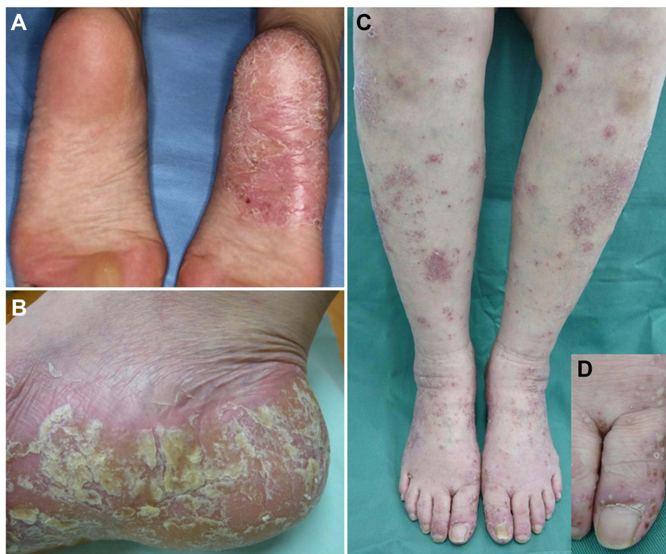
Figure 1 Atypical features of PPP. (A) Unilateral plantar involvement. (B) Plantar hyperkeratosis and erythematous lesions. (C) A number of ill-defined erythematous lesions with scales on the lower extremities. (D) Small pustular lesions.

In the majority of cases, clinical manifestation presents with typical features such as small pustules, scales, and erythema on the palms and/or soles, and thus biopsy is not