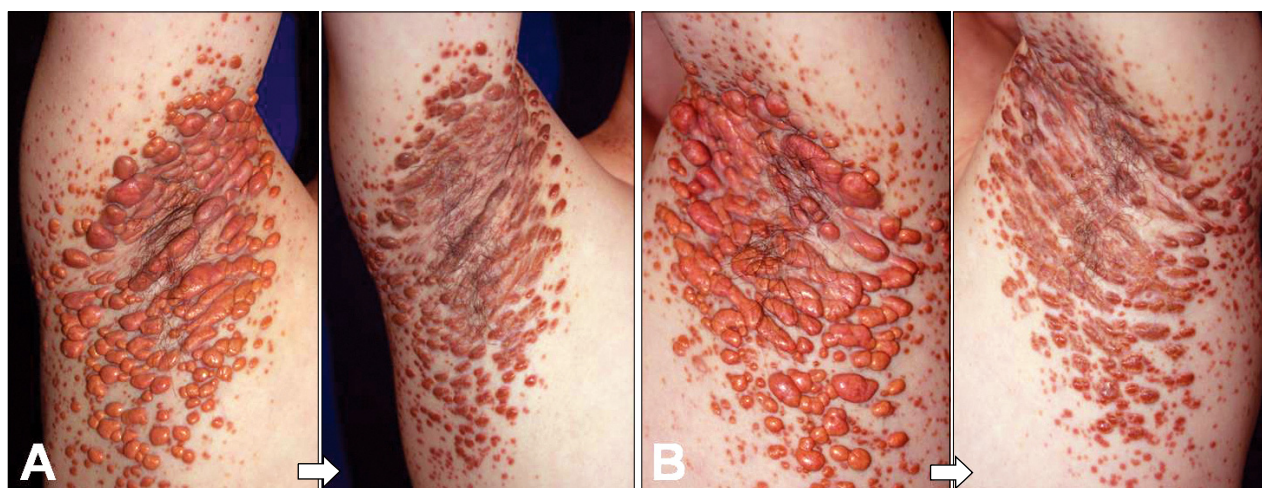
Fig. 2. Markedly flattened yellow-brownish papulonodules on both axillae (A: right, B: left) after 1 year of lipid-lowering agents in combination.

reverse cholesterol transport and anti-inflammatory activity 7 . Though the use of combination therapy of lipid lowering agents is still rare in dermatologic fields except in one reported case in XD with partial remission 5 , there are several articles reporting a superior effect of combination therapy on the treatment of hyperlipidemia 7,8 . The mechanism of combination treatment of XD is still ambiguous; we thought it may result from decreased inflammation and reduced formation of foam cells. Before visiting our clinic, our patient's lesions showed