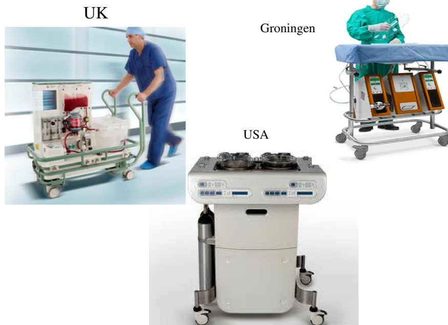
Figure 2 Machine preservation systems used worldwide. The perfusion preservation machine in the UK is applicable for both cold and normothermic conditions (left). The machine developed in the USA is for cold preservation (bottom).

donor is evaluated and consent for organ donation is obtained. In addition, using NECMO to maintain organs offers the theoretical benefit of applying cytoprotective substances that can support functional recovery.