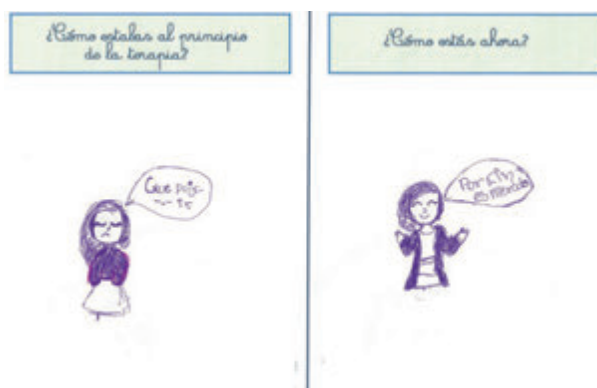
Figure 4. Before and now drawing by Aurora, an 11-year-old girl (the drawing said in the left hand side What a drag!, and in the other side It's Wednesday at last!).

Narrative of the drawing representing the current state of the therapy: Now I'm like: it's Wednesday at last (...) I