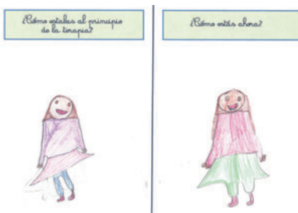
Figure 3. Before and now drawing by Bárbara, a 6-year-old girl.

One of the participants also mentioned changes in terms