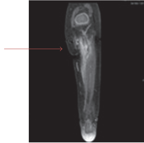
FIGURE 2: Minimal soft tissue edema surrounding the left proximal tibial metaphysis and diaphysis with corresponding mild enhancement suggestive of early acute osteomyelitis.

Vitamin D and calcium are both well known to play an important role in bone development and strength.