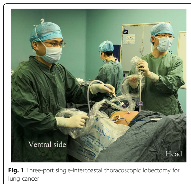
Fig. 1 Three-port single-intercostal thoracoscopic lobectomy for lung cancer

Systemic mediastinal lymphadenectomy, including the subcarinal lymph node and at least three lymph stations, was routinely performed in all surgeries (Fig. 2). Before September 2016, the main chest tube (26-Fr) was