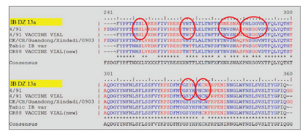
Figure-1: Predicted epitope alignment of deduced amino sequences of HVR S1 gene. New field Algerian isolate and selected infectious bronchitis virus vaccine vial reference strains.