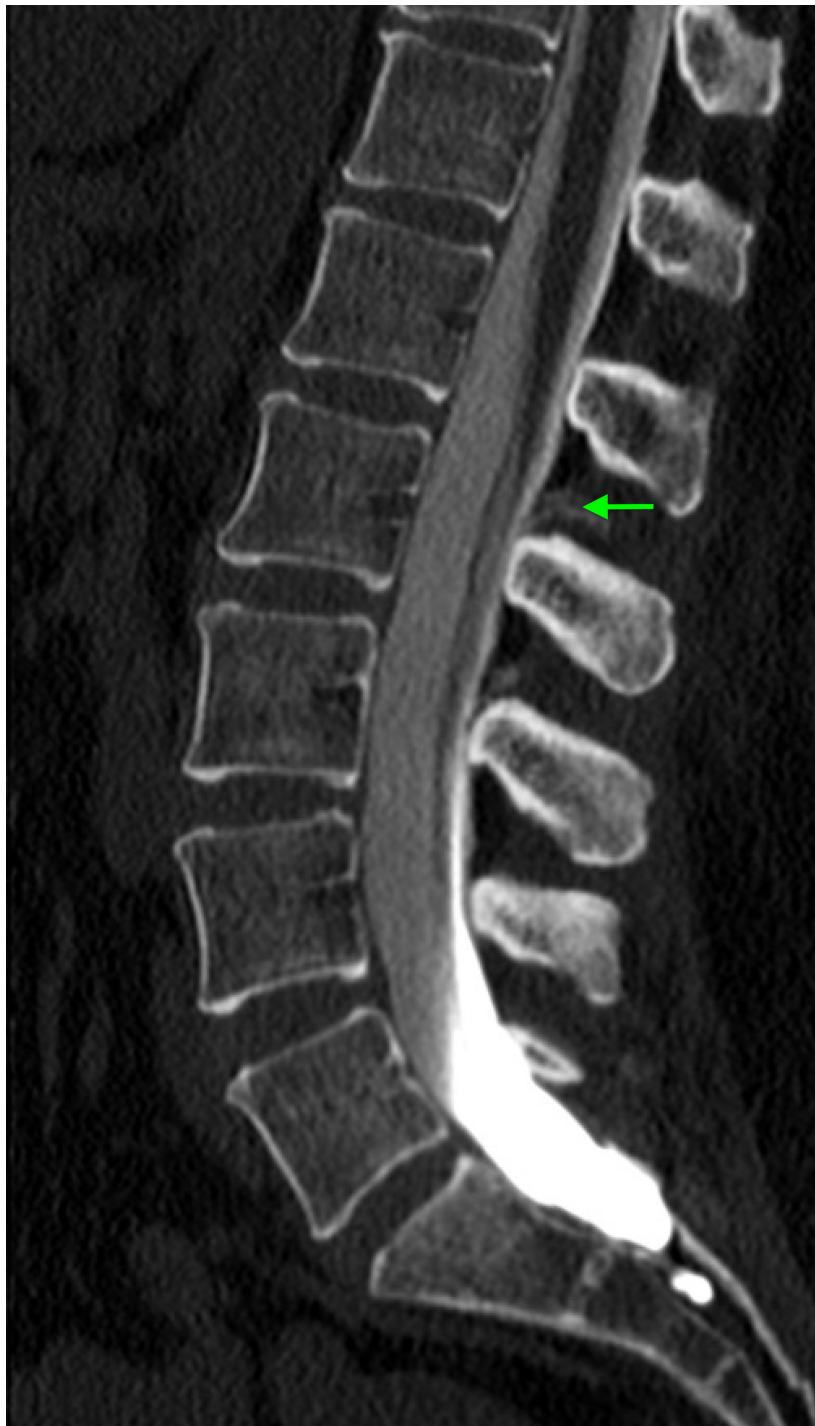
FIGURE 3: CT myelogram of the lumbar spine revealing extradural contrast extravasation within the interspinous soft tissue at L1-L2 with additional spread between the right L2-3 and L3-4 nerve roots.