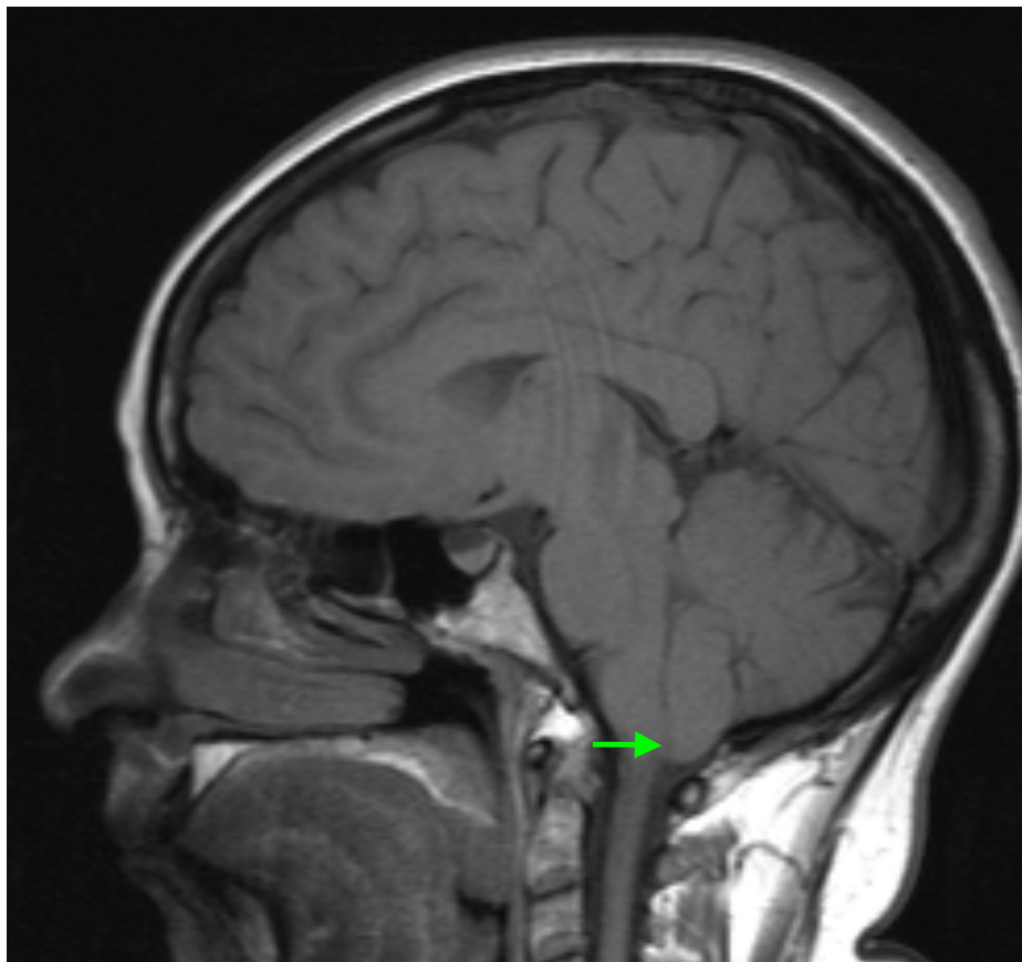
FIGURE 1: T1 sagittal MRI revealing a Chiari I malformation with approximately 5-6 mm of tonsillar herniation and no upper cervical syrinx.

Her MRI revealed a Chiari type I malformation with approximately 5-6 mm of tonsillar herniation and no upper cervical syrinx (Figure 1). The post-contrast MRI sequences revealed enhancement of the convexity dura, which can signify negative intracranial pressure, but did not demonstrate evidence of pituitary hyperemia, generalized brain sag, or subdural effusions (Figure 2). A CT myelogram of the lumbar spine was obtained, and it revealed extradural contrast extravasation within the interspinous soft tissue at L1-L2 with additional spread between the right L2-3 and L3-4 nerve roots (Figure 3). The myelogram used the L5-S1 interlaminar spaces for the injection of contrast material. These findings were consistent with a CSF leak originating an L1-2. She received an epidural blood patch at L1-2 and experienced almost immediate headache relief. At her one-month follow-up visit, her diplopia had improved, her CN VI palsy and ptosis had resolved, and her MRI showed stable tonsillar herniation with stable venous sinuses. At her three-month follow-up visit, her headaches, dizziness, and diplopia had completely disappeared, and she was able to resume her normal activities.