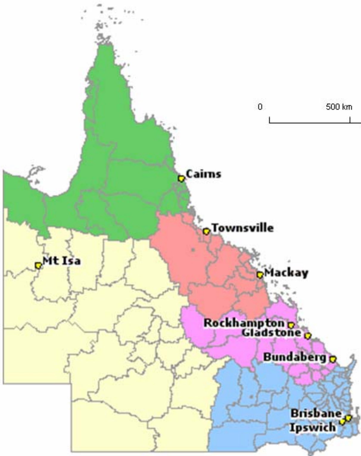
Figure 2 Map of Queensland.