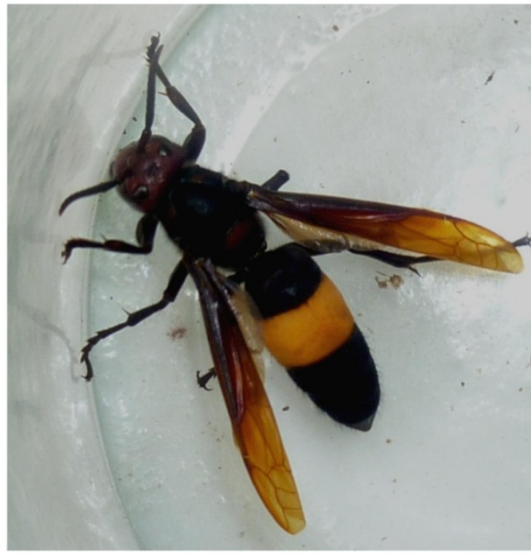
Figure 1 Hornet, Vespa affinis .

sugar was 134 mg/dl. Anaphylactic shock was the diagnosis and 0.5 ml (1:1000) adrenalin im, Hydrocortisone 200 mg iv and Chlorpheniramine 10 mg iv were given immediately. She felt better and improved over next 20 minutes and her blood pressure picked up to 106/70 mmHg.