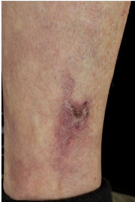
Fig 2. Retiform purpura with ulcer on lower leg.

consulted. Clinical examination revealed retiform purpura with ulceration on both legs and lower abdomen (Fig 2). The differential diagnosis was a medium-vessel vasculitis or calciphylaxis.