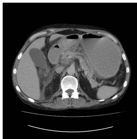
Fig 1. Computed tomography of pancreas showing severe pancreatitis.

A 54-year-old man developed recurrent episodes of severe abdominal pain associated with a raised amylase level and deranged liver function. Computed tomography scan of the abdomen and magnetic resonance cholangiopancreatography confirmed pancreatitis. On imaging, there was evidence of pancreatic duct dilatation, but no renal calculi were visible ( Fig 1 ). He was given the diagnosis of recurrent pancreatitis and treated