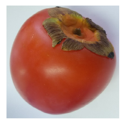
Figure 1. Persimmon, Diospyros kaki L. fruit from Algarve, Portugal.

In several studies, it has been described that the concentration of nutrients and other functional components of persimmon is higher in the skin than in the pulp [9]. However, the skin of the fruit is typically discarded when it is consumed with a spoon (Figure 1) when it is very ripe, or during the drying process of the persimmon [1]. This process of fruit preservation is widely used in China and Japan, given the large quantities produced, its usage in a high number of culinary recipes, and the need to preserve it in significant quantities in a long-lasting and safe way [10].