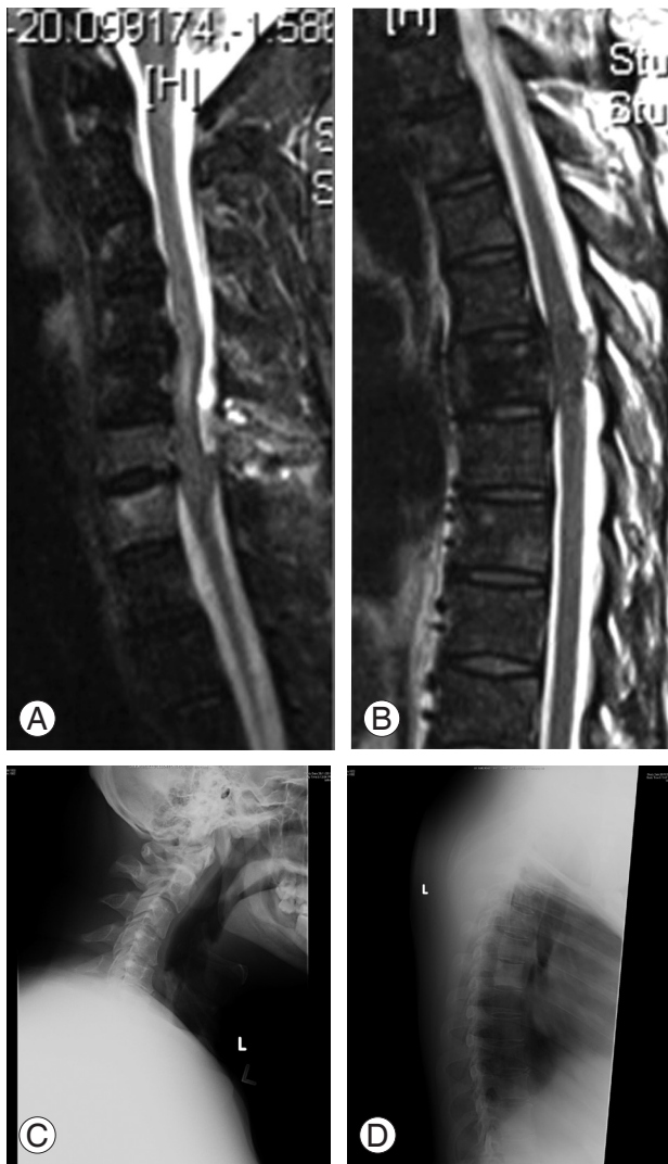
Fig. 1. (A) Magnetic resonance cervical spine showing high intensity at the C5 and C6 vertebral bodies. There is an associated cord compression with cord signal changes at the level above. (B) Thoracic lesion at T5 causing cord compression. (C) Lateral cervical. (D) Lateral thoracic spine preoperative radiograph showing sclerotic lesion at T5.

Blood investigation showed normal infective and inflammatory markers (white blood cell, 9.02; erythrocyte sedimentation rate, 6; C-reactive protein, 1.9), with an abnormally high prostate-specific antigen (PSA>100). A Tc99 bone scan showed vertebral hotspots similar to those identified on the MRI. There were no other lesions