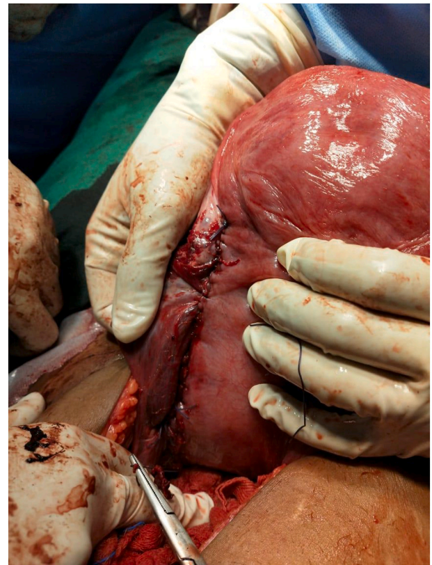
Fig. 2. Rupture site repaired in two layers.

There was no undue prolongation of latent and active stage of labour. Active stage was well monitored with partograph, intermittent foetal auscultation and cardiotocography as per institutional protocol. In active labour, features of rupture were promptly detected and patient was taken for laparotomy after confirming the diagnosis on ultrasound. Due to early diagnosis and well-coordinated multidisciplinary approach, we were able to provide quick surgical intervention which is usually the key to successful management of uterine rupture [7]. We were able to prevent significant maternal morbidity in terms of excess blood loss, blood transfusion, post-operative sepsis and need for prolonged hospitalization. We were able to successfully repair the uterine rupture site, thus preserving her fertility and allowing her to reconsider child birth in future.