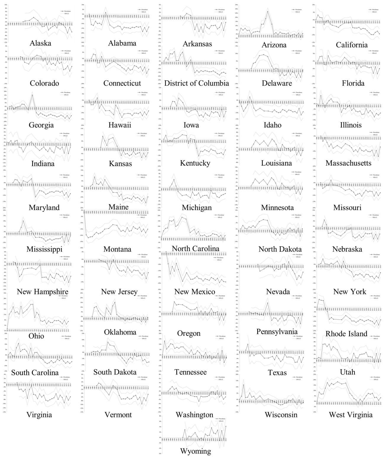
Fig 2. Regression-adjusted changes in the prevalence of leisure-time physical inactivity.