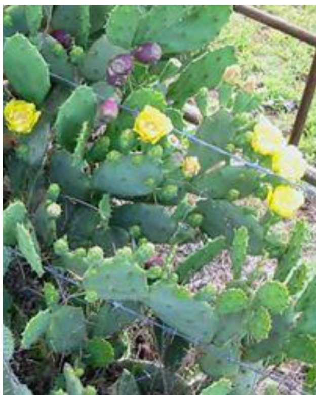
Figure 1 OD

OD is a member of the Cactaceae family (Figure 1), which is found in all temperature zones and has been used as an ornamental plant [12, 15]. The Cactaceae consists of 130 genera and 1500 species, which have remained largely unexplored for their therapeutic potency [12, 16]. OD cactus has a specific name: OD (Ker-gawl) Haw. and also called as Australian pest pear, common prickly pear, Dillen's