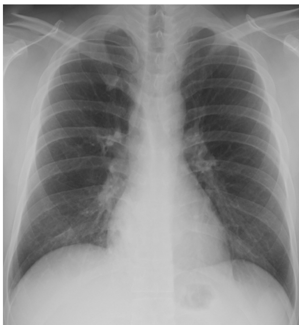
Figure 1 A chest radiograph revealed infiltration in the lower lobe of right lung.

64.8%; lymphocytes, 28.1%; monocytes, 4.8%; eosinophils, 2.0%; basophils, 0.3%); platelet count, 20.9 \times 10^4/\mu\text{L} ; aspartate aminotransferase, 36 IU/L; alanine aminotransferase, 101 IU/L; lactate dehydrogenase, 191 IU/L; alkaline phosphatase, 263 U/L; glucose, 132 mg/dL; Glycated hemoglobin, 5.9% (normal 4.3%–5.8%); C-reactive protein, 0.13 mg/dL; erythrocyte sedimentation rate, 13 mm/1 hour; and serum \beta -D-glucan 11.4 pg/mL (normal <11.0 pg/mL). The patient was negative for human immunodeficiency virus antibodies. There was a very low titer of Aspergillus antigen in his blood sample (1.1; cut-off index 1.0), and his blood was negative for Aspergillus antibodies. No Candida antigens were detected