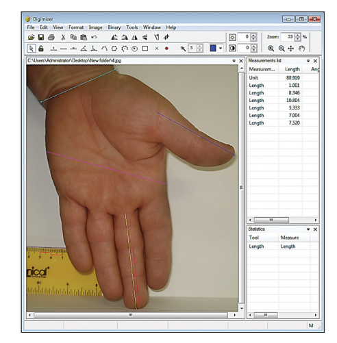
Figure 3: Image analyzing software for hand images