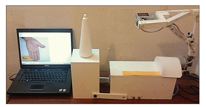
Figure 2: Hand photo anthropometry set

Hung et al. designed an anthropometry computer system and the results of their study demonstrated that some peripheral dimensions like around the neck has a significant difference in manual method, but linear dimensions like height of arm had a high degree of accuracy. They found out that the reasons for this difference were because of missing some key spots in the image and also the weak