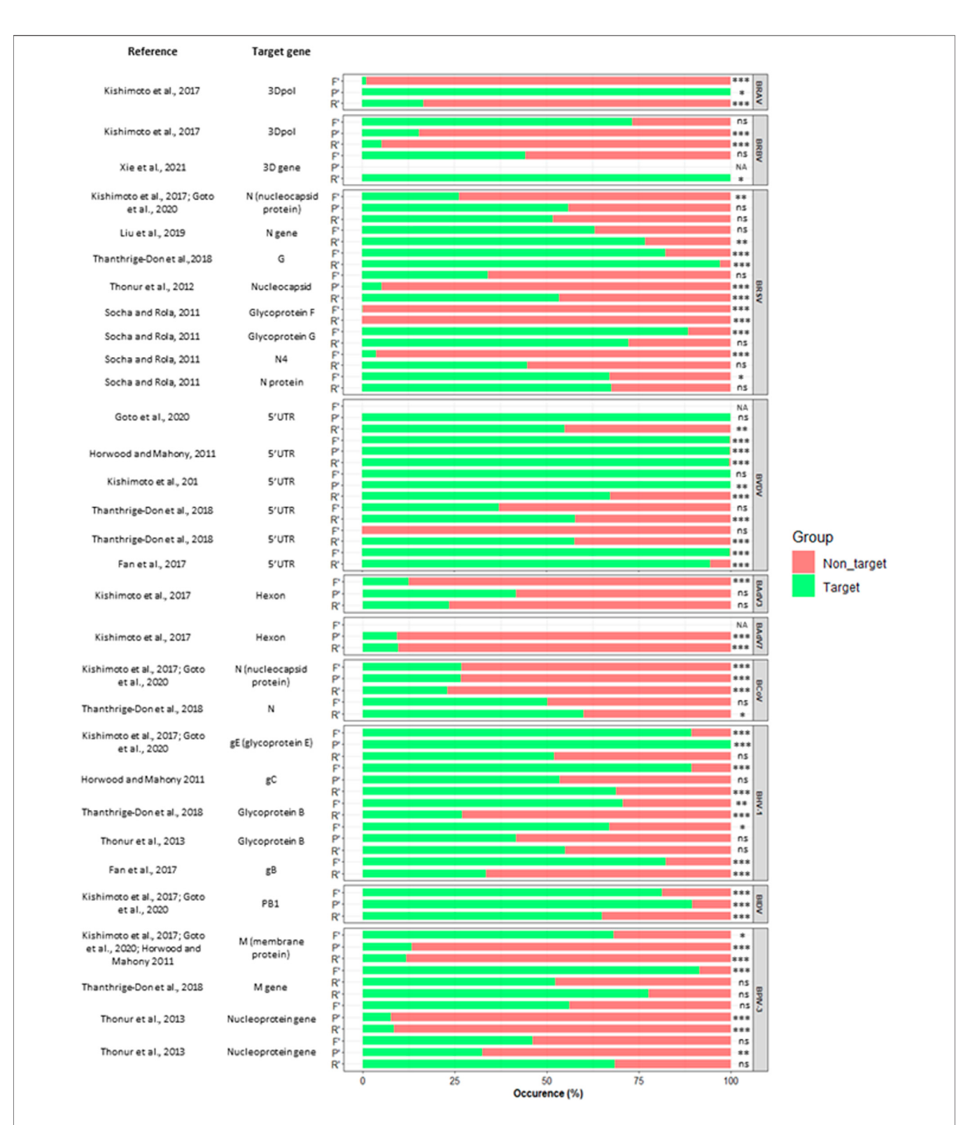
FIGURE 2 Occurrence of target and non-target sequence alignment for published primer and probe sequences targeting the respiratory disease-causing viral pathogens in cattle. Bovine coronavirus (BCoV), Bovine herpesvirus 1 (BHV-1), Bovine rhinitis A virus (BRAV), Bovine rhinitis B virus (BRBV), Bovine respiratory syncytial virus (BRSV) Bovine influenza D virus (BIDV) Bovine viral diarrhea virus (BVDV), Bovine parainfluenza virus 3 (BPIV-3), and Fisher's exact test; p > 0.05 ns, p \le 0.05^* , p \le 0.01^{-4*} , p \le 0.001^{-4*} .