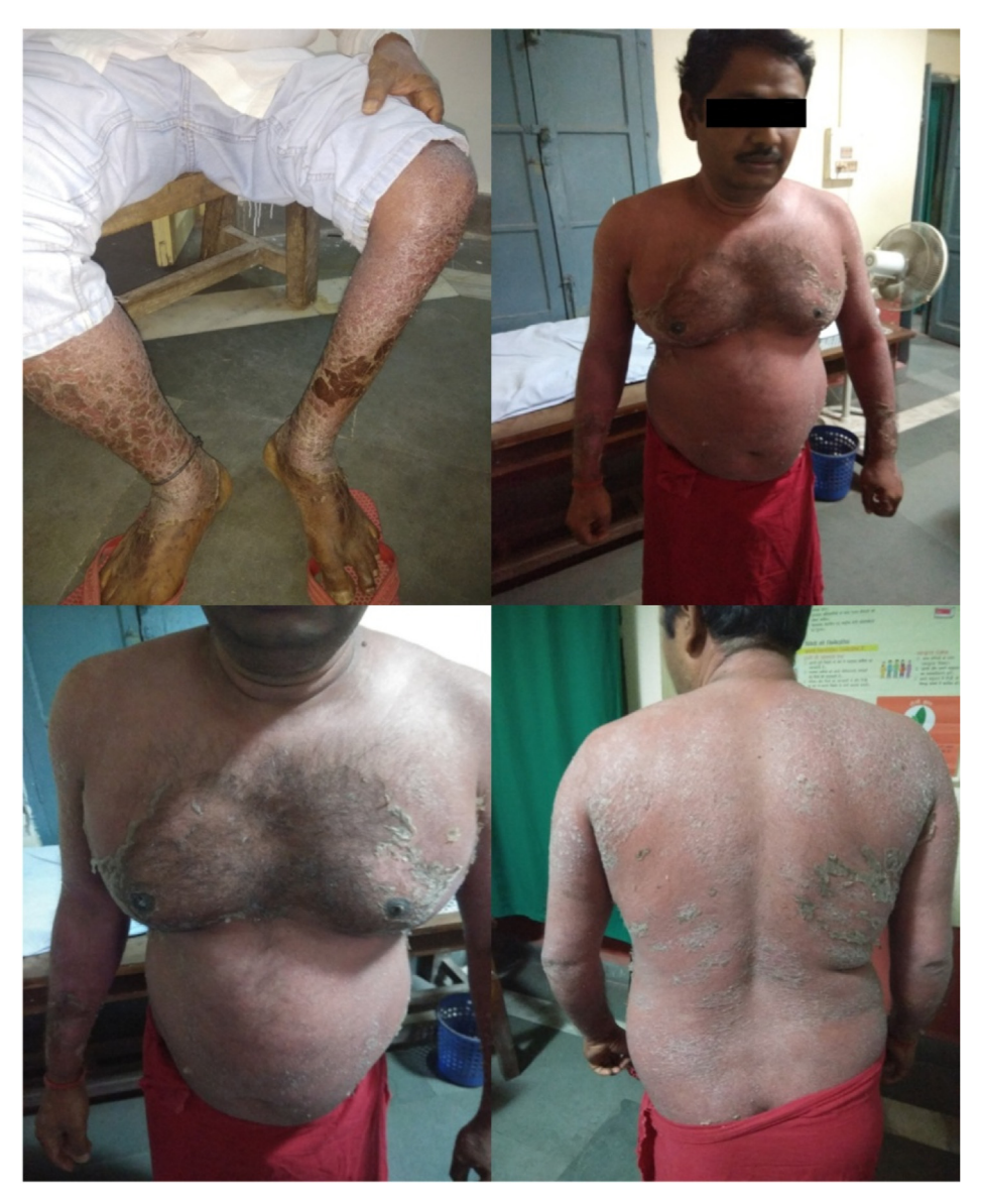
Fig. 2. Psoriatic Erythroderma (PsE) patient before treatment.

elevated Pitta ), Raktaprasadana (~blood purifying) and Amapachana (~metabolization of toxins i.e. Ama ) leading to Jwarnashana (~antipyretic) and Kushthanashana (~Anti dermatitis) effect [4,16]. Thus, regarding initiation of treatment strategy, Panchapaniya decoction (~ Shadangpaniya devoid of Shunthi ) and P. churna were the choices at the first visit. Little modified Shadangpaniya which is indicated in febrile illness (named as Panchapaniya decoction—Table 3) was administered due to dominance of Pitta-Rakta in this case along with P. churna , which is advocated in all types of Kushtha [17]. As the patient was suffering from the scaling and exfoliation of the epidermal skin, which is suggesting the involvement of vitiated V. dosha . Thus, T. churna (Table 3) being Anulomaka was given for Vatanulomana (~reducing morbid V. dosha ) [18].