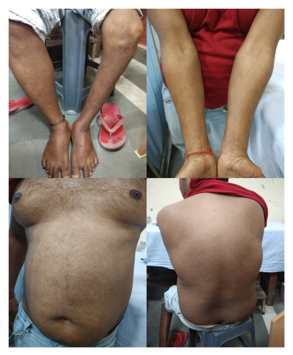
Fig. 3. Psoriatic Erythroderma (PsE) patient after treatment.

the content of Lippu oil, which possesses proven antimicrobial activity [20]. Lippu oil does not cause any irritation instead it is soothing to the skin when used topically perhaps due to Madhura rasa-Sheeta virya of coconut oil along with it possess Vranaropaka (wound healing) property [21]. The patient confirmed the experience of exfoliation after S. lepa and softening of the skin after Lippu oil he further added.