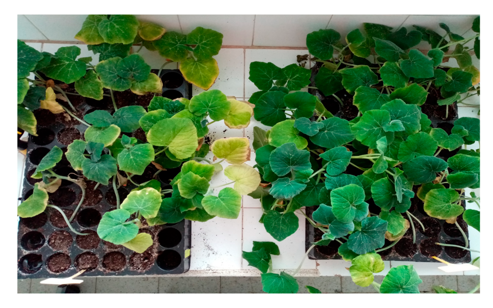
Figure 3. Gummy stem blight symptoms on squash plantlets. Control ( left ) and seeds treated with 0.5 mg/mL Cymbopogon citratus essential oil ( right ) 30 days from seeding, with plants kept at room temperature ( 22 \pm 2 °C).