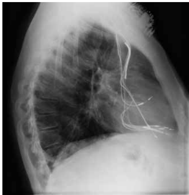
Figure 1: Initial lateral chest X-ray showing four leads crossing the tricuspid valve and causing severe TR.

With the hope that his severe TR would improve without a pacemaker lead disrupting leaflet coaptation, pacemaker reimplantation was performed, with a bipolar lead