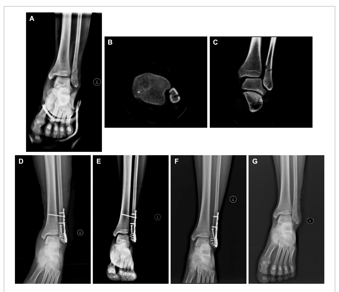
FIGURE 3 A Male patient with Weber type B, Lauge—Hansen SER-III, bimalleolar equivalent fracture treated with fibula ORIF and trans-syndesmotic screw fixation. Preoperative anteroposterior x-ray image (A), axial CT scan image (B), and coronal CT (C) scan image showed the fibular fracture, increased medial malleolus clear space and inferior tibiofibular syndesmotic disruption. (D) Postoperative anteroposterior image showed the reduction of fibular fracture, medial malleolus clear space, and distal tibiofibular joint. One month (E), one year (F), and post internal fixation removal (G) anteroposterior x-ray images did not show any displacement or dislocation, no ankle osteoarthritis was found either. ORIF, open reduction and internal fixation; CT, computed tomography.

treatment of unstable ankle fracture-associated syndesmotic injury without deltoid ligament repair (7, 14, 15). However, malreduction of the tibiofibular syndesmosis, incongruity of the fibula within the incisura, fibular rotation, etc., were observed on postoperative CT scan, which may contribute to poor functional outcomes (8, 15–17). In addition, screw syndesmotic fixation alters physical biomechanical movement, which needs additional surgery to remove fixation screws. Therefore, more anatomic methods such as tightrope fixation, suture button fixation, etc., for the syndesmotic fixation were carried out and obtained better clinical outcomes compared with screw syndesmotic fixation (9, 10, 18–20). In the other