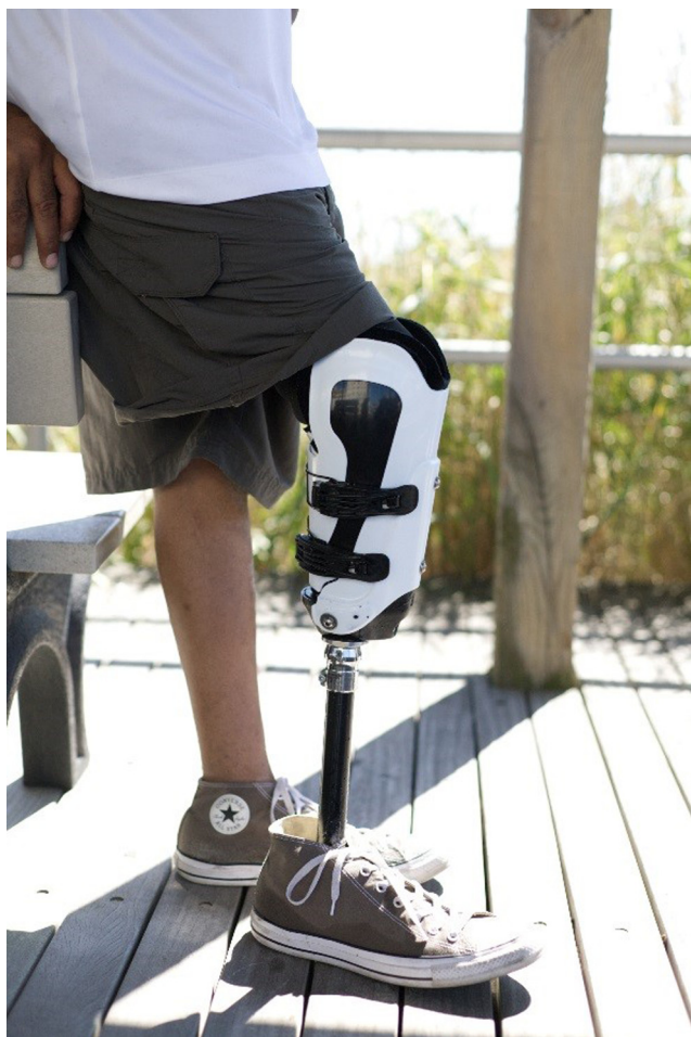
Fig 1 Lateral view of the iFIT prosthesis showing locking buckle closure system.

Philadelphia region through advertisements. Inclusion criteria were adult participants (>18y old) who had undergone transtibial amputations (both traumatic and non-traumatic); no open wounds, sutures, or staples; cleared to initiate use of a prosthesis by their surgical team or physiatrist; and intact sensation on the residual limb. Exclusion criteria included excessive phantom pain, neurologic conditions that caused marked weakness in the contralateral limb or gait abnormalities, or weight over 260 lb, which is the maximum recommended weight set by the manufacturer for commercial componentry used (pyramid connector, pylon, tube clamp) in the prosthesis. Persons who did not have a conventional prosthesis, for whom the iFIT device would be their first prosthetic device were included in this study. These individuals were included to assess this adjustable socket system when used as a preparatory prosthetic. As part of the consent process, these participants agreed to participate in outpatient physical therapy for gait training prior to using the iFIT prosthesis on their own. The therapist cleared them when they were safely ambulating. This study was approved by the University of Pennsylvania Institutional Review Board and is registered under clinical trials number NCT02886936. Participants all gave written consent prior to participation.