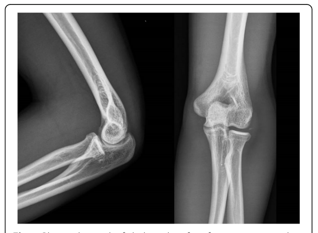
Fig. 4 Plain radiographs failed to identify soft tissue injury and elbow instability

Instead of using a previously reported method for securing the extended arm during elbow arthroscopy in