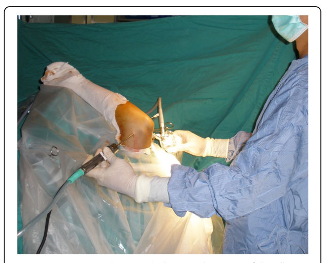
Fig. 2 Intraoperative photograph during arthroscopy of the elbow

The mean duration of follow-up was 17.1 months (range, 12 to 24 months). The average clinical outcome, as assessed by MEPS, was 89.2 \pm 7.2 (range, 75 to 100); all were graded as good (9 patients) or excellent (23 patients). Final motion arc averaged 113.3 \pm 11.8 (range, 85 to 140) of flexion. Two patients (cases 5 and 6) had a final arc of motion less than 100°. Case 5 had a