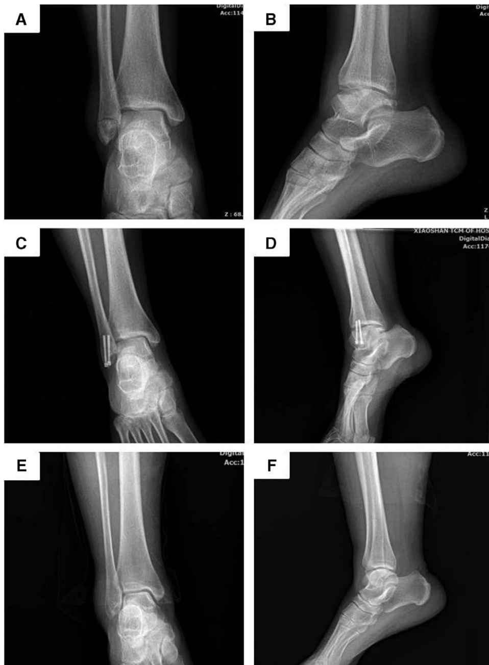
Figure 1. Female, 62-years-old, right ankle fracture caused by sprain (type A of Weber classification). (1a, 1b) Preoperative AP and lateral X-ray films showed lateral malleolus transverse fracture, and the fracture block was complete. (1c, 1d) Postoperative AP and lateral X-ray at 4th month after operation showed the distal fibula fracture was fixed with two Herbert screws. (1e, 1f) At the 12th month after operation, the internal fixation device was removed. AP and lateral X-ray films showed fracture was healed and the function of ankle was well.

plate and anatomical distal fibula composite plate was higher than that of 1/3 tube plate, so reconstruction plate and anatomical distal fibula composite plate were preferred; but in case of underweight patient, lack of thick soft tissue coverage on distal fibula or poor local soft tissue conditions, the thinner 1/3 tube plate or anatomical distal fibula composite plate was more suitable so as to reduce the interference of implant on the soft tissue. If the patient also had significant osteoporosis, the locking plate fixation was preferred. In this study, among the patients with such type of injury in this group in the study, 5 patients selected the 1/3 tube plate, 6 patients selected the reconstruction plate, 4 patients selected the anatomical distal fibula composite plate, and 3 patients selected the anatomical distal fibula locking plate.