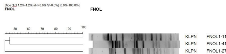
Figure 2. Pulsed-field gel electrophoresis (PFGE) of 3 CTX-M-15-positive Klebsiella pneumoniae strains.

Pulsed-field gel electrophoresis (PFGE) of 3 CTX-M-15-positive Klebsiella pneumoniae and 2 CTX-M-15-positive Escherichia coli strains showed that those were strains with unique restriction genetic profiles. Therefore, clonal horizontal transmission was ruled out (Figures 2 and 3).