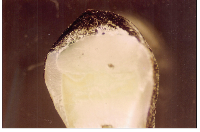
Figure 1: Ormocer: An aesthetic direct restorative material. Linear dye penetration in Group I – Spectrum TPH with Prime and Bond NT, Mean – 0.250 mm

3. Admira when used with Admira Bond showed lesser microleakage than Spectrum TPH used with Prime and Bond NT (Dentsply Caulk, Milford, USA), the difference being statistically insignificant.