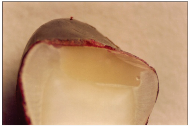
Figure 6: Ormocer: An aesthetic direct restorative material, Linear dye penetration in Group VI – negative control, Mean – 0.000 mm

It consists of ceramic polysiloxane, which has low shrinkage as against the organic dimethacrylate monomer matrix seen in composites (the resin matrix of Spectrum TPH consists of a BIS-GMA adduct, ethoxylated bisphenol – A- dimethacrylate, BIS – EMA, and triethylene glycol dimethacrylate). To the