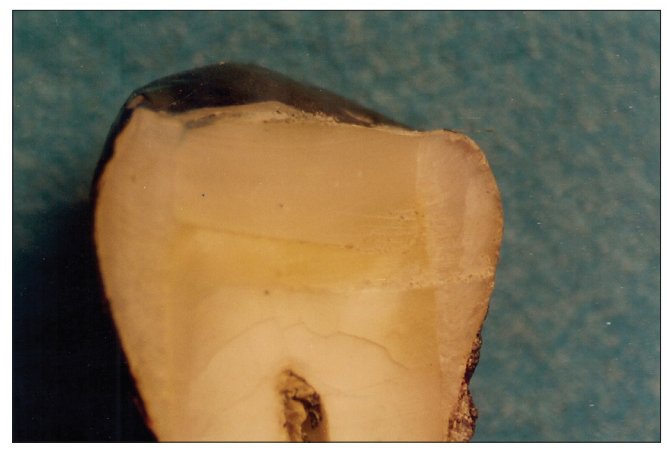
Figure 4: Ormocer: An aesthetic direct restorative material. Linear dye penetration in Group IV – Admira with Admira Bond, Mean – 0.200 mm