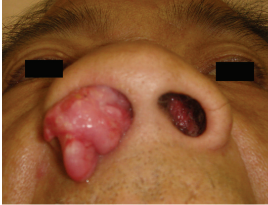
FIGURE 1: Preoperative view of the nose. The huge tumor filled in the bilateral nasal cavity. The tumor spread from the right to the left.

the posterior part of the nasal septum. Thus, the tumor was an advanced unilateral tumor that has eroded into the other side by erosion of the septum. In the progressive dissection, the tumor was completely removed in both sides, and the surgical margin was free of disease. The operating time was 5 hours, and intraoperative blood loss was 300 mL. Permanent histopathologic examination revealed IP without malignancy. The postoperative course was uneventful, and no recurrence was observed at the 2-year follow-up examination.