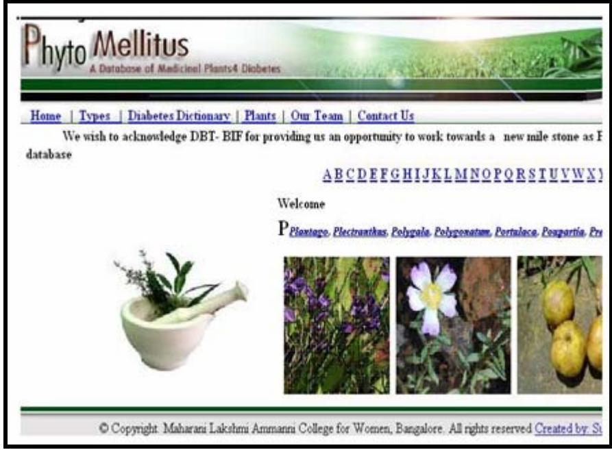
Figure 2: A screen shot of P record entry in Phyto-Mellitus is shown