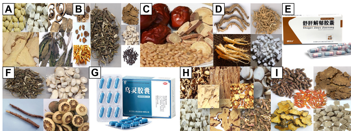
Figure 1 The nine formulas examined in this review.

suye were the core herb pairs to alleviate depression-like serotonergic and dopaminergic changes in mice. 33 Furthermore, aqueous and lipophilic extracts of BHD showed the greatest antidepressant effects, whereas the polyphenol fraction showed a moderate effect. 22 BHD reduced immobility time in the forced-swim test (FST) and tail-suspension test (TST), increased 5-HT and 5-hydroxyindoleacetic acid levels in the hippocampus and striatum, and decreased serum and liver malondialdehyde (MDA) levels in mice with a depression-like phenotype. 34 Ethanol and water extracts of BHD reduced c-Fos expression in cerebral regions of rats subjected to chronic mild stress (CMS) to a level comparable to that of fluoxetine. 35 BHD significantly