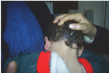
FIGURE 2: Low hairline and low dysmorphic auricles.

the presence of two gonads. Histological study of gonadal biopsies revealed testicular tissue with the presence of regular size seminiferous tubules containing Sertoli cells without the presence of germ or Leydig cell. A cardiovascular, renal, and auditory systems examination were normal. In a staff, bringing together endocrinologists and pediatric surgeons, the majority opinion was to maintain the female gender of the child after parental consent and achieve a feminizing genitoplasty (vaginoplasty and clitoridoplasty) with bilateral gonadectomy.