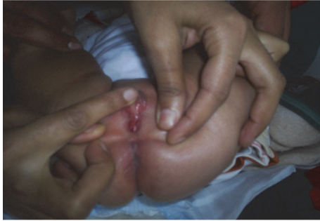
FIGURE 1: Appearance of the external genitalia.