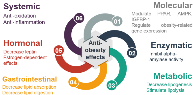
Figure 3. Different mechanisms for anti-obesity effects of green tea

The preventive role of GT in obesity was assessed in several studies. It is thought that supplementation with