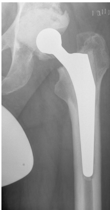
Figure 1: Radiograph of a hip spacer of a 63year old man with late periprosthetic infection of the left hip

operation to remove the spacer and to implant the new prosthesis revealed the presence of abraded cement debris, in particular, zirconium dioxide particles [unpublished data].