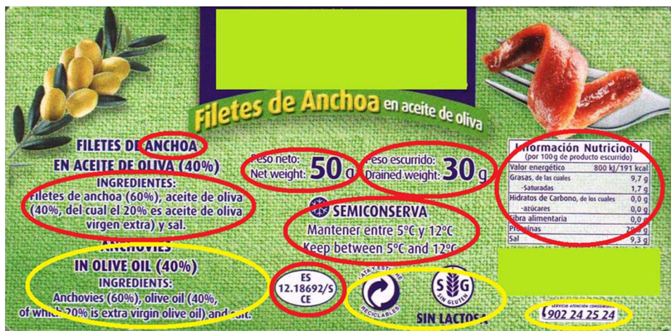
Fig. 1. Information collected for each commercial sample. Mandatory Information in anchovy labels (red marks) and not mandatory (yellow marks).