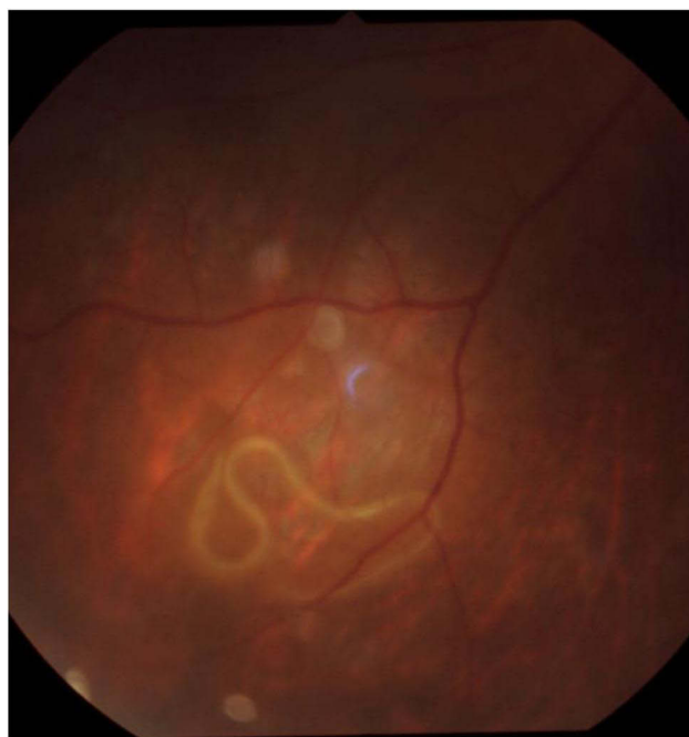
Figure 1 The subretinal larva in the inferotemporal quadrant.

The helminth can migrate to the orbit by traveling between the optic nerve and its sheath then penetrate the