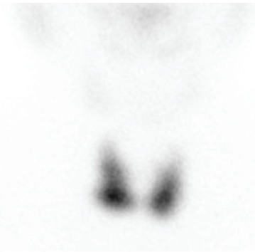
FIGURE 2: Technetium scan revealing bilateral diffuse increased tracer uptake at 5.9% [normal 0.5–3.5%], consistent with Graves' Disease.

the cytotoxic activation of CD4 T-cells is amplified further, primarily via a Th1 mediated pathway, and interacts with abnormally expressed major histocompatibility complex class I antigen surface expression on thyrocytes. The end result is apoptosis and destruction of thyrocytes and thyroid follicles [8]. Exogenous IFN- \alpha may also influence switching to a Th2 pathway, which can result in the development of autoantibodies (e.g., anti-TPO, anti-TG) resulting in thyrotoxicosis, due to thyroid follicular rupture and release of stored thyroid hormones into the circulation. Thyroiditis is confirmed by low pertechnetate uptake scan and positive thyroid autoantibody titres. Thionamides are contraindicated in this scenario given the likelihood of exacerbating thyroid dysfunction,