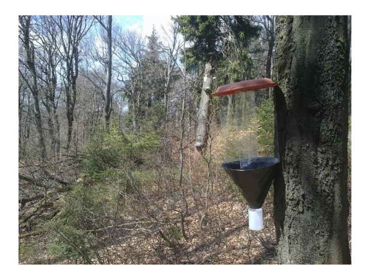
Figure 1. Trunk-tree window trap used in Krkonoše and Orlické hory for trapping of the Tetrodon-tophora bielanensis . Author: Jakub Horák.

We used passive (i.e., non-attractive) window traps placed on tree trunks (Figure 1), which are highly effective for the sampling of even flightless fauna [13]. Each trap consisted of crossed transparent plastic panes ( 400 \times 500 mm), a protective top cover, and a funnel leading down into a container with a solution of water, salt, and detergent. Each trap was placed at a height of 1.3 m, facing south.