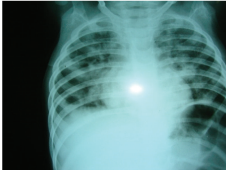
FIGURE 1: Chest radiograph revealed diffuse infiltration in right lung with thick walled cavities in mid and lower zone. Infiltrations were also seen in left upper parahilar region.