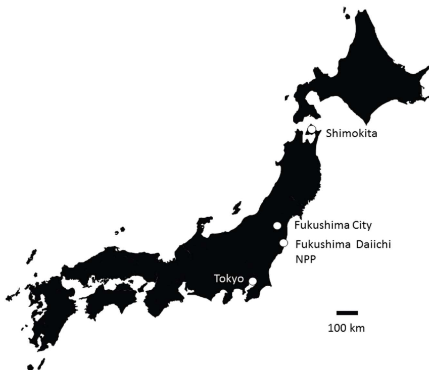
Figure 1 | Map showing the location of Fukushima and Shimokita, where the present investigation was conducted. This map was modified from blank open license maps provided by the Geospatial Information Authority of Japan.