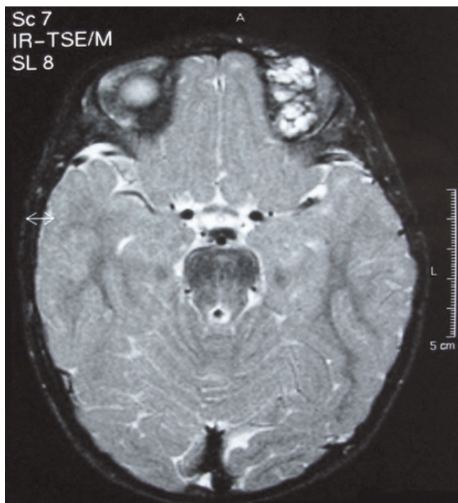
Figure 2. Cavernous hemangioma of the left upper eyelid in the same patient, on an axial T2- weighted MRI, after intravenous injection of Gadolinium.