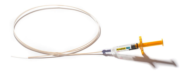
Fig.1 A: PuraStat system ready-to-use. A 5 mL PuraStat syringe is connected with the application catheter

After application of PuraStat, the procedural data were documented on a case report form (CRF). The CRF recorded the following data: Localization of the bleeding site, bleeding type according to the Forrest classification, primary or secondary use, previous or additional application of established techniques for haemostasis (submucosal injection of adrenaline or fibrin glue, number of hemoclips, argon plasma coagulation). 3 and 7 days after application, the therapeutic success of PuraStat was documented, defined as a stable clinical condition without signs of rebleeding. If patients had rebleeding, underwent surgery or if another serious adverse event occurred within 30 days following the application of PuraStat, the events were documented separately. All examiners were asked in the CRF about their satisfaction with the use of Purastat. The option was to state yes or no when asked for satisfaction, no specific graduation was requested although free comments on the topic could be reported.