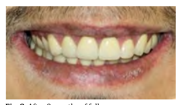
Fig. 8. After 9 months of follow-up

Oral hygiene instructions were emphasized, which included dental flossing after each meal, tooth brushing three times a day, daily use of 0.2% sodium fluoride (NaF) mouthwash, chewing sugar-free gum, use of saliva