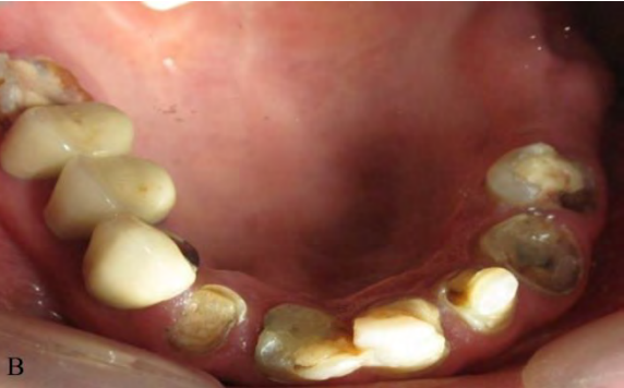
Fig. 1. (A): Intraoral view of the lower jaw. (B): Intraoral view of the upper jaw.