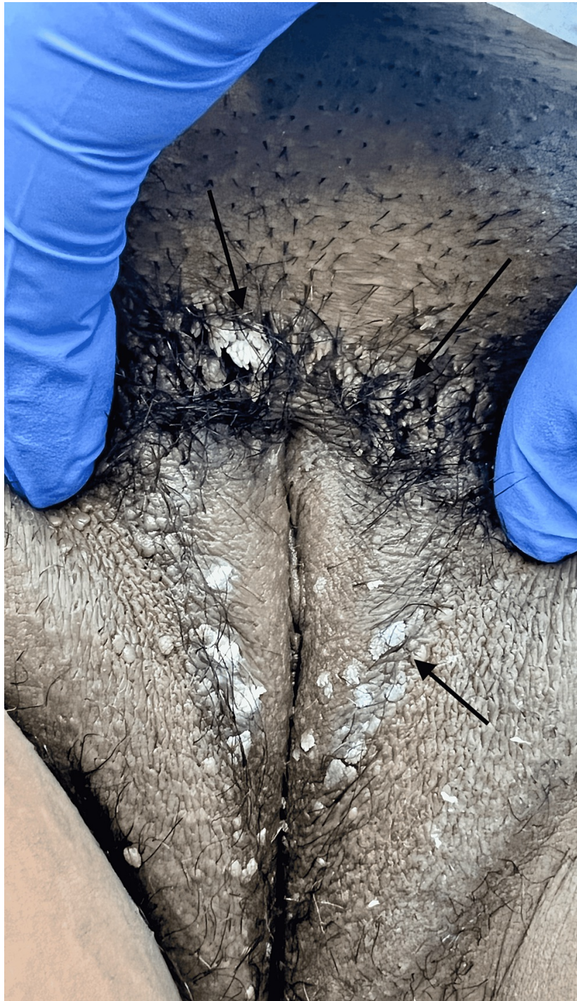
FIGURE 2: Vulvar lesions immediately after first trichloroacetic acid (TCA) treatment

appearance; however, the patient was complaining of great discomfort due to itching. She consented to proceed with the TCA treatment (Figure 2). The patient tolerated the first TCA treatment well. After treatment, multiple warts still persisted but five warts of larger size reduced in size. The patient agreed to continue TCA treatment weekly and will follow up in 6 months for a Pap smear.