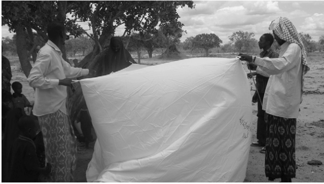
FIGURE 1. A Dumuria net being displayed in the field.

standard LLINs (these results have not been published in peer-reviewed journals) (P. Guillet, unpublished data).